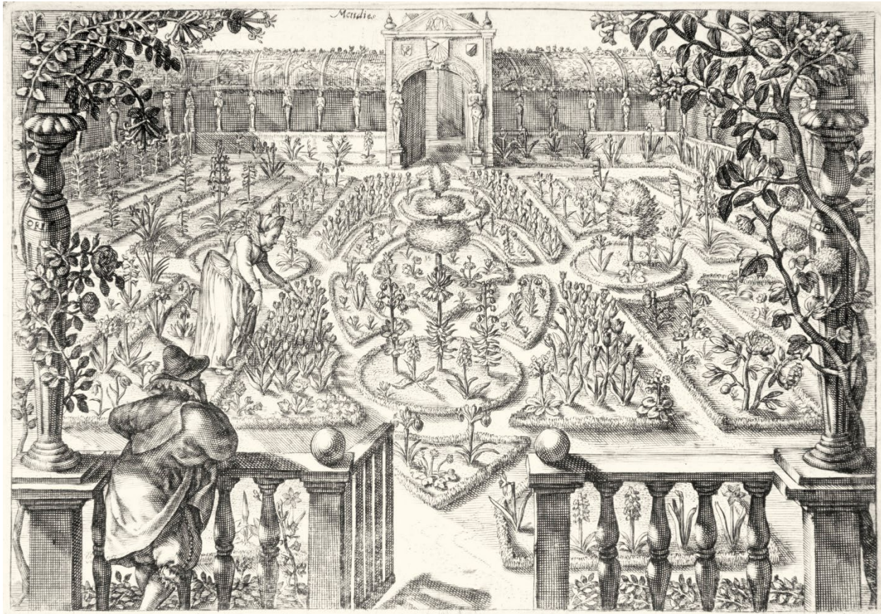
Fig 4.21 Crispijn de Passe, Hortus Floridus, Utrecht 1615

Crispijn De Passe's impressive garden print offer a highly appealing view of a Dutch garden layout in classical geometrical style. From an enclosed portico, one oversees a courtyard garden designed with an array of geometrically shaped boxwood parterres or planting beds, filled with spring flowers, from tulips to crown imperial and fritillaria. This image is iconic for what would come to be known as the "Golden Age" of Dutch formal garden art and architecture. Apart from geometrical garden design, it also reflects the early 17 th -century development of floriculture and horticultural knowledge; knowledge that was taken along on the passage to New Netherland. While De Passe's print shows an ideal, imaginary garden, a place that only could be afforded by the very wealthy, garden layouts like this did exist in early 17 th -century Netherlands, and later in the century also in New Netherland.